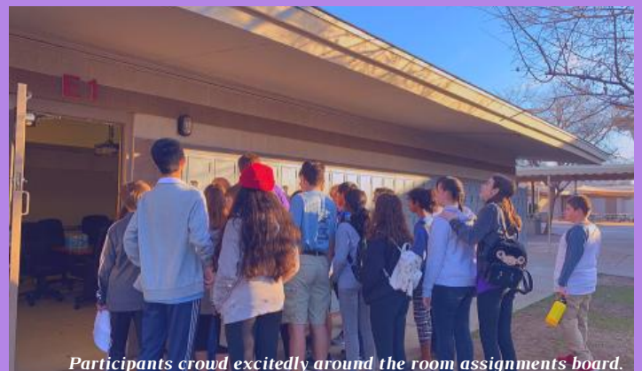
Participants crowd excitedly around the room assignments board.