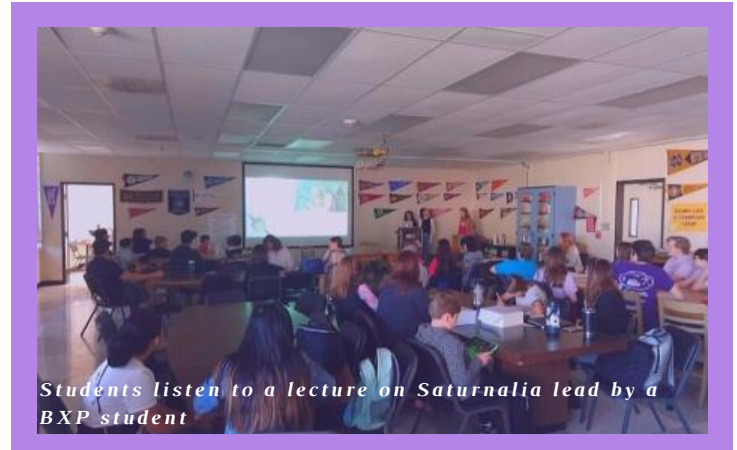
Students listen to a lecture on Saturnalia lead by a BXP student

After all of the light-hearted certamen fun, the students participated in a poster-making contest that was judged off of each team's ability to illustrate an aspect of Saturnalia. To the right, two poster designs can be seen. The one on the left depicts Cronos as a grumpy Santa hunting for baby Zeus while the other gods and goddesses sit around in their father's stomach, and the one on the right is a giant Uno reverse card, highlighting Saturnalia's master-slave role reversal.