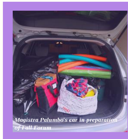
Magistra Palumbo's car in preparation of Fall Forum