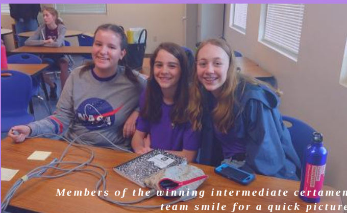
Members of the winning intermediate certamen team smile for a quick picture