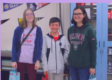
First Place (Advanced)