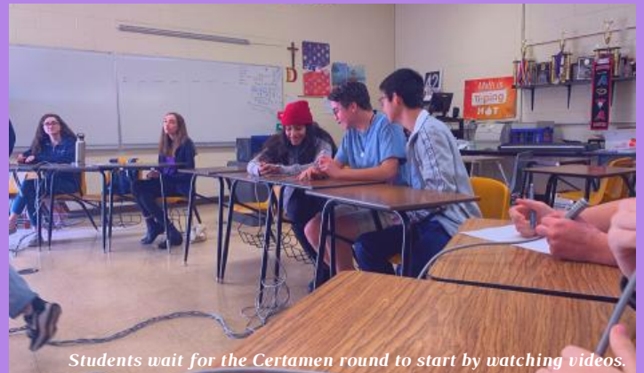
Students wait for the Certamen round to start by watching videos.