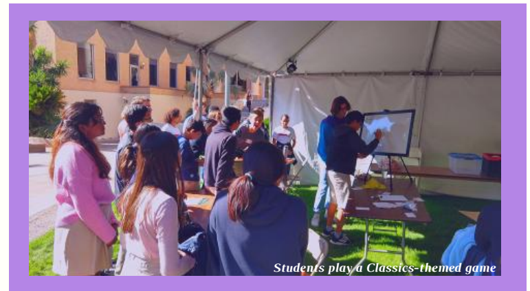
Students play a Classics-themed game