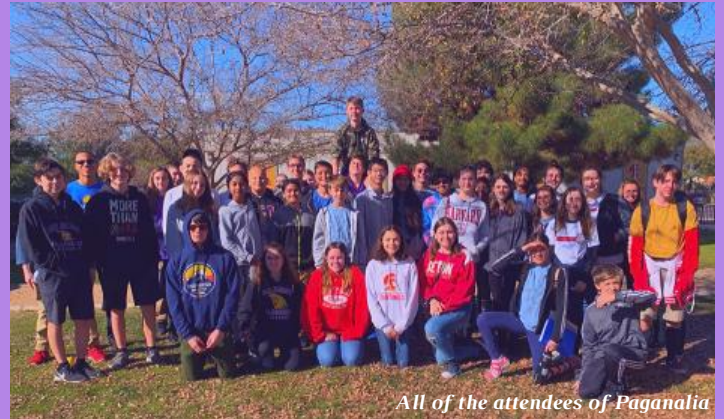
All of the attendees of Paganalia