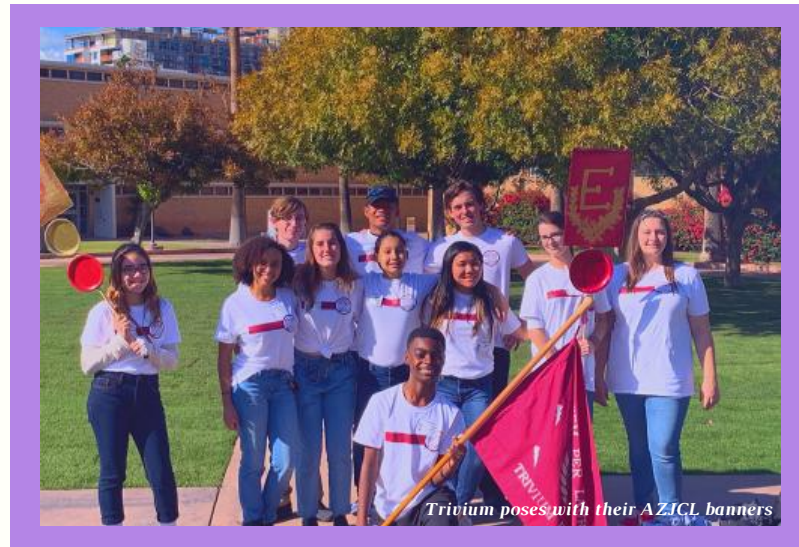
Trivium poses with their AZICL banners

Quid est Fall Forum? Fall Forum is that state event you attend at ASU that completely epitomizes your JCL experience. When you first arrive, you are given a flag with a letter that signifies which group you belong in and are immediately whisked off into one of three activities: candy mosaic making, gladiator sword fighting, or lecture listening. At the candy mosaic station, you are allotted an assortment of candy, some frosting, and a graham cracker to create an edible masterpiece relating to this year's convention theme: "Omnes...summa ope niti decet, ne vitiam silentio transeat." or "It benefits all to strive with greatest effort, lest they pass their lives in silence." If you are up for some physical activity, perhaps you would be interested in the gladiator battles, as you face off with your friends and valiantly strike each other with foam noodles until one of you is declared the victor and rewarded with jolly ranchers. However, if you've ever wondered how to properly sacrifice a cow or reach the underworld safely, then you'd probably want to check out the lecture station. From the fun activities to all the interesting lectures, Fall Forum has something for everybody and was nothing short of extraordinary.