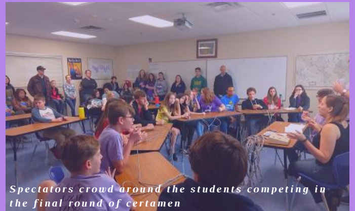
Spectators crowd around the students competing in the final round of certamen

There's a "U" in Lupercalia! During the third competitive certamen tournament of the year, Scottsdale Preparatory Academy used this tagline to invite any and all AZJCLers to their Lupercalia celebration. The event started out with a quick lecture on the history of Lupercalia and the activities the Romans would have done in preparation for the festival. Many historians speculate that our modern holiday Valentine's Day is actually an offshoot of Lupercalia, as they share a similar date of celebration. However, Roman "Valentine's Day" is very different from ours. For instance, the Romans' initial ritual sacrifice of male goats occurred in Lupercal cave to honor the she-wolf or "lupa" who nursed Romulus and Remus. Additionally, because Lupercalia also symbolized fertility, priests would run around and whip women who believed they would be blessed with children if they were hit. As such, some of the certamen rounds featured questions about the customs of Lupercalia, and SPA even created their own "Lupercal scansion cave." All in all, this event was definitely one of the most memorable yet!