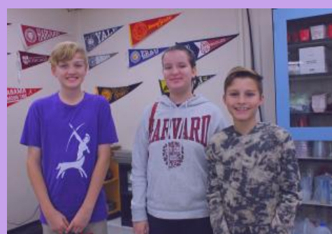
First Place (Intermediate)