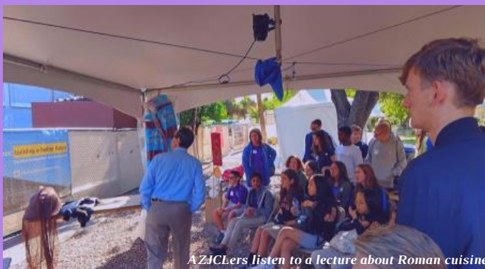
AZICLers listen to a lecture about Roman cuisine