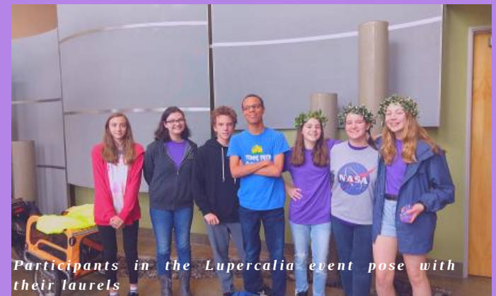
Participants in the Lupercalia event pose with their laurels