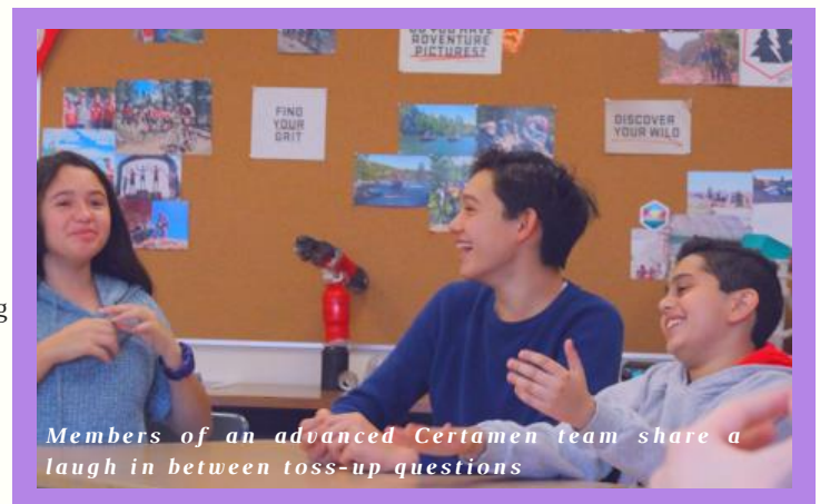
Members of an advanced Certamen team share a laugh in between toss-up questions