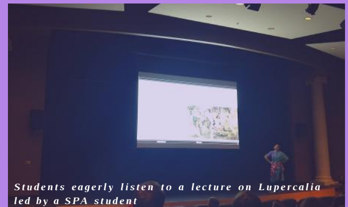
Students eagerly listen to a lecture on Lupercalia led by a SPA student