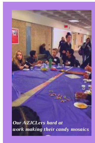
Our AZICLers hard at work making their candy mosaics