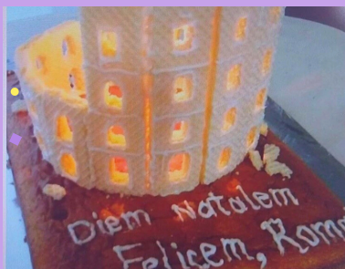
A birthday cake for Rome made by TPA classics!

Finally, on April 21st, the anniversary of Rome's birthday, we celebrated Rome's founding by remembering the journey of Romulus and Remus, who were nursed by a she-wolf and established this legendary city. Naturally, we also baked some delicious cakes too!