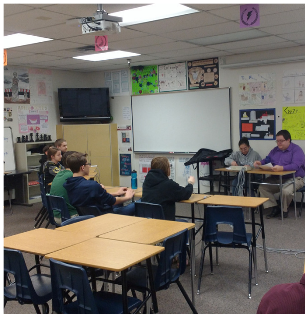
Pictured to the left: Various students and volunteers playing certamen on Gilbert Classical Academy's campus. January 20, 2018