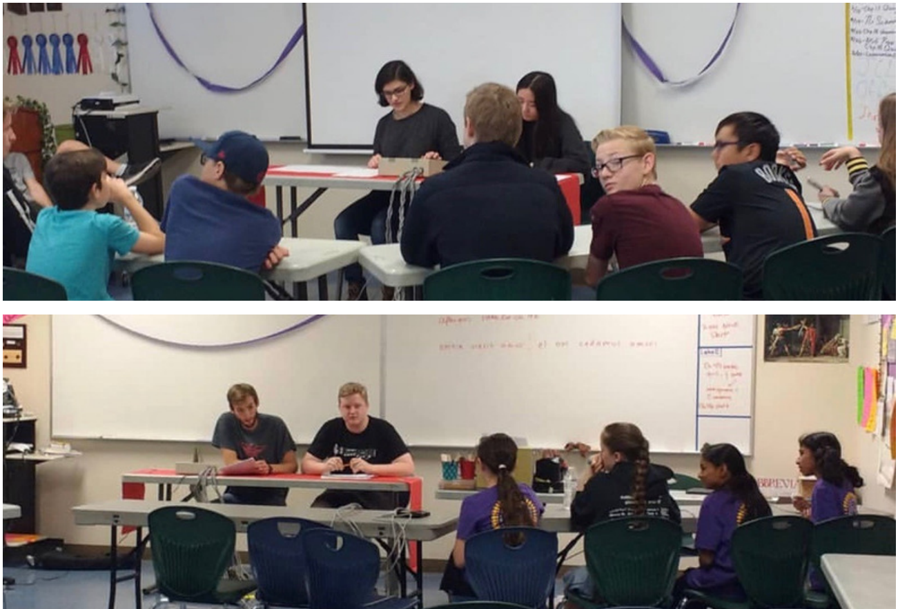
Pictured: Various students from Arizona schools playing certamen in celebration of Lupercalia. February 10, 2018

Typically celebrated on February 15th, Lupercalia was an ancient Roman festival celebrated annually to avert evil spirits and to purify the city. To celebrate, Scottsdale Preparatory Academy hosted an event on February 10th to get various Arizona schools to celebrate. The event had a variety of activities: certamen, scansion contest, and an activity called "telestrations" (similar to the game "Telephone" but done with illustrations). During the Roman times, Lupercalia began with a sacrifice by the Luperci, Lupercalia's own priesthood, of goats and a dog. Thus, to honor this rite, Scottsdale Preparatory Academy ended the event with food, but most importantly with a goat cake!