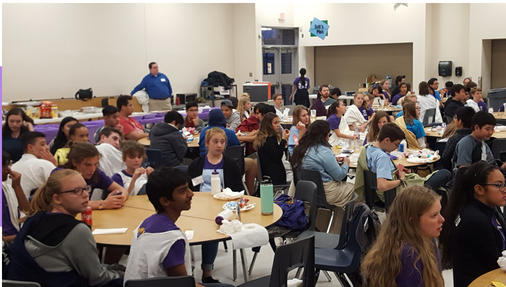
Pictured to the left: Students listening intently during the Second General Assembly. March 3, 2018

Test your knowledge! Test your strength! Test your skills! Join us for our last big major event of the school year! (p. 4)