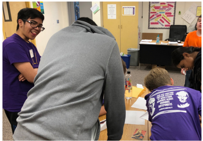
Pictured: A group figuring out how to escape the room by collaborating, using reasoning, thinking outside-of-the-box. March 2nd, 2018

Someone is planning to overthrow the Senate and it's up to you to figure out who it is. Be sure not to get caught in the process! On March 2nd, the pre-convention fun activity took place on Gilbert Classical Academy's campus (the same place where the State Convention will take place). Students were divided and put into groups of varying ages, grade, and schools, and had to work together in order to get out of the room. The puzzles forced students to think outside-of-the-box with few hints. The goal at the end of the night was not only to escape the room and have the best score (lowest score wins), but to get acquainted with other students from different areas of Arizona, and even Nevada! Both Pre-Convention and State Convention brings hundreds of like-minded students who are interested in Classics together to compete and strive to do their best.